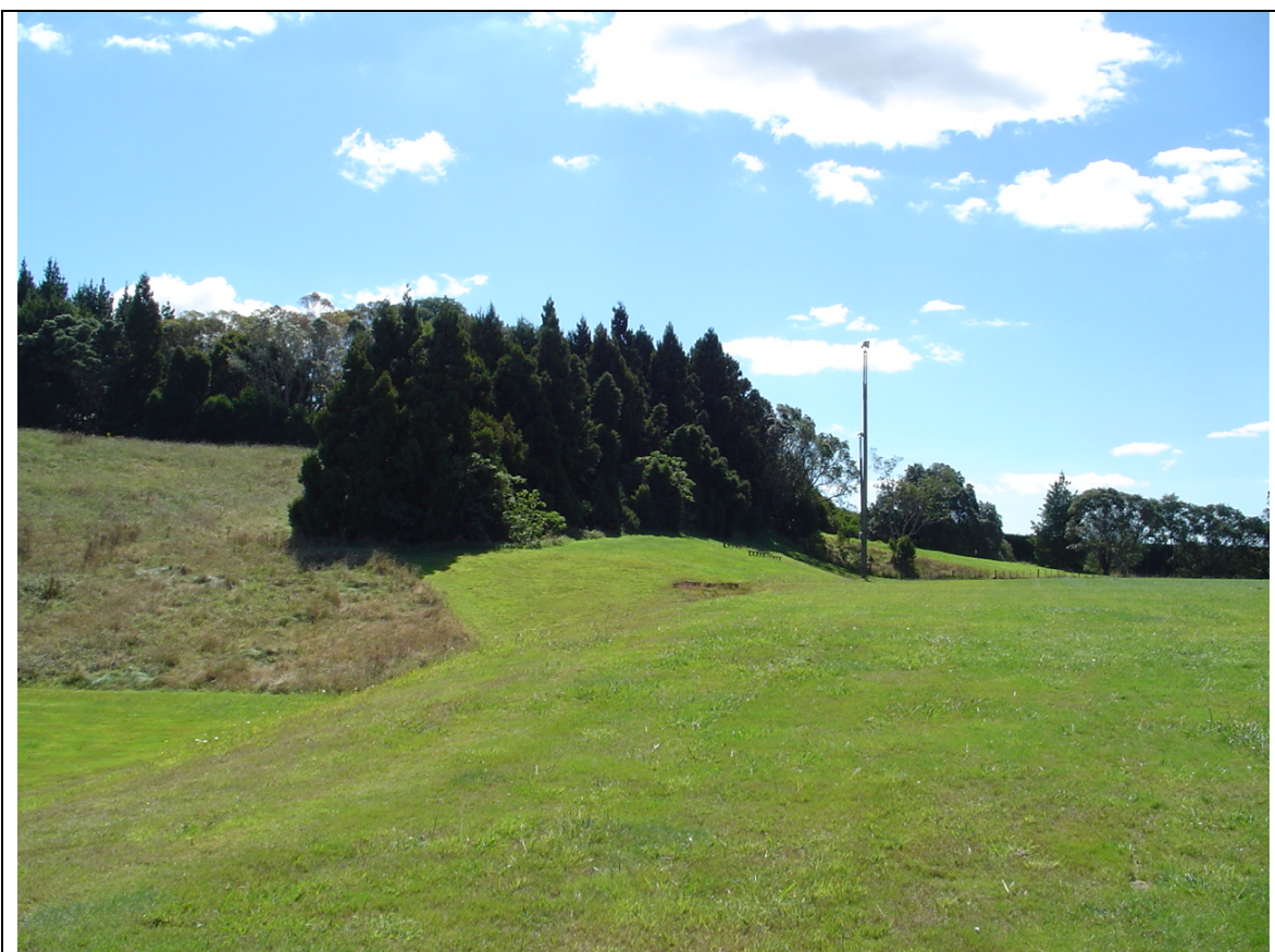
View from training area along Eastern boundary with old Cryptomeria shelterbelts in background