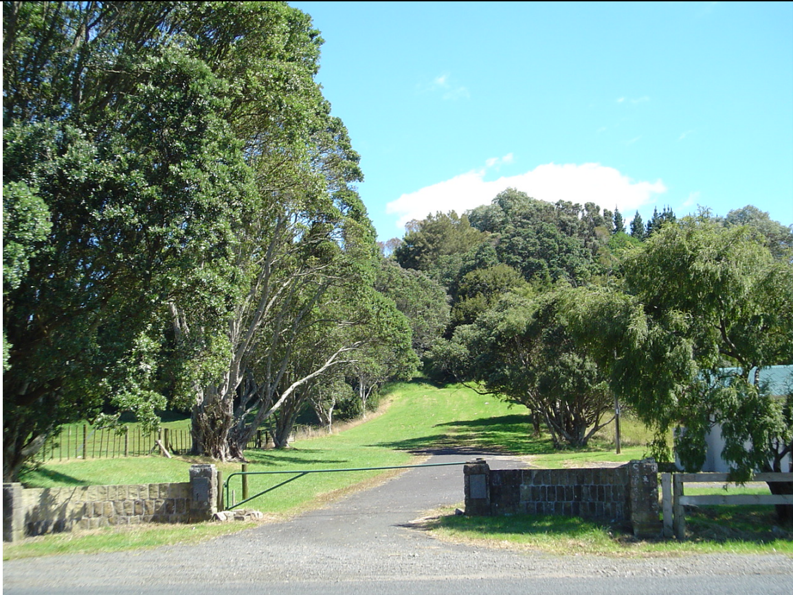
Existing main entrance into reserve with memorial plaque