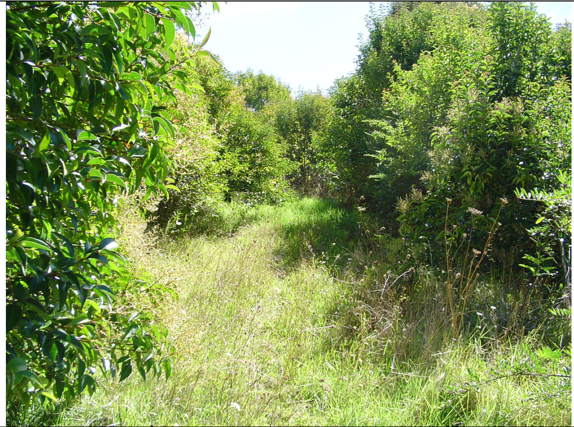
Overgrown old track to the summit. The course of this track forms the base for the mountain biking trail. Access by bikes will be limited to the track only, in order to prevent damage to historical feature, and vegetation.