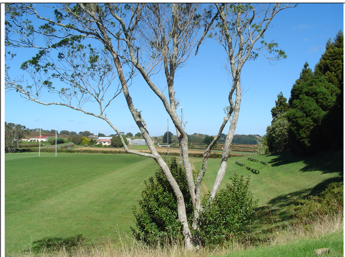
View of sports field and spectator area