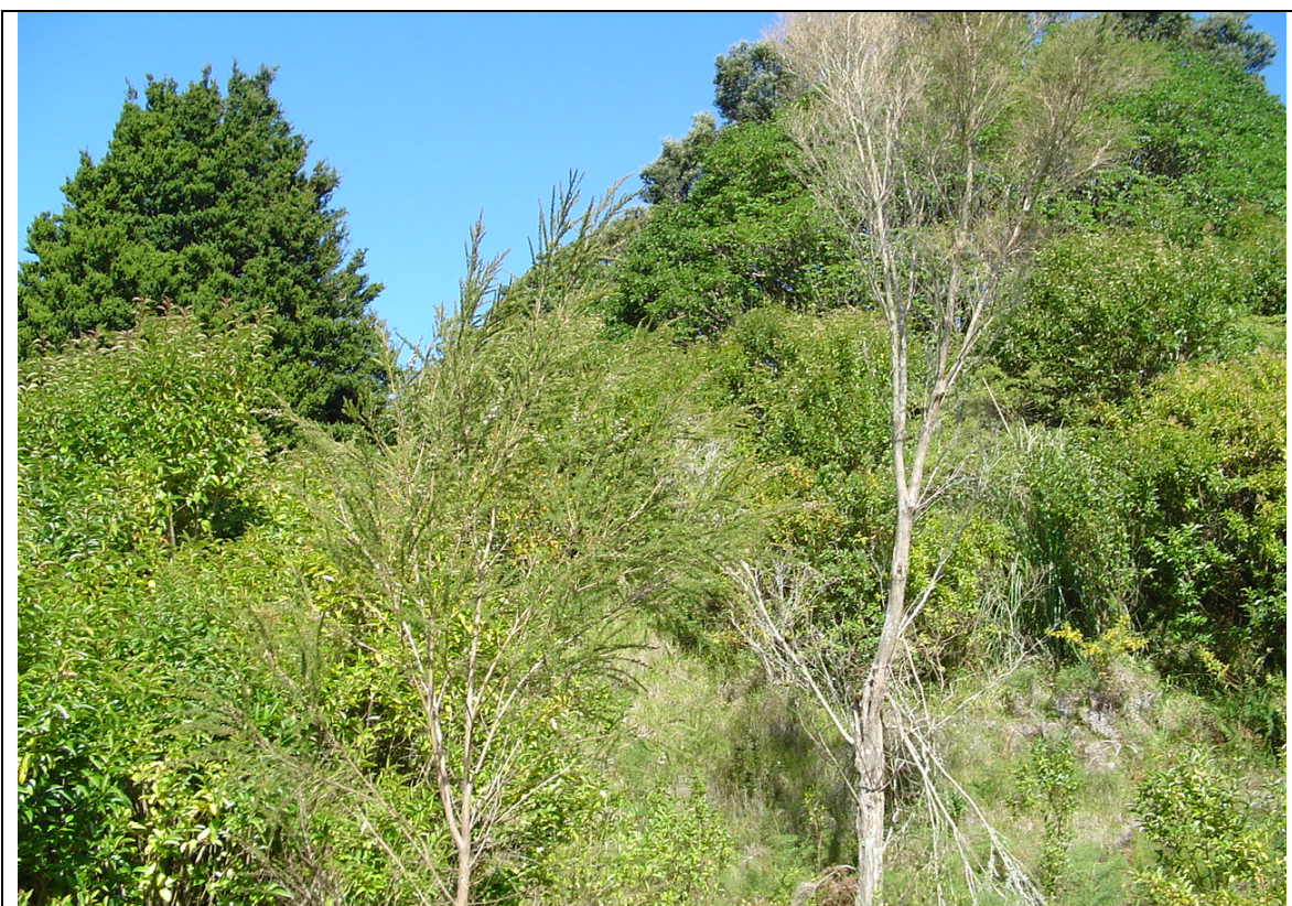
Vegetation on volcanic cone. Mainly consisting of a mixture of native and exotic species, as well as numerous weed species.