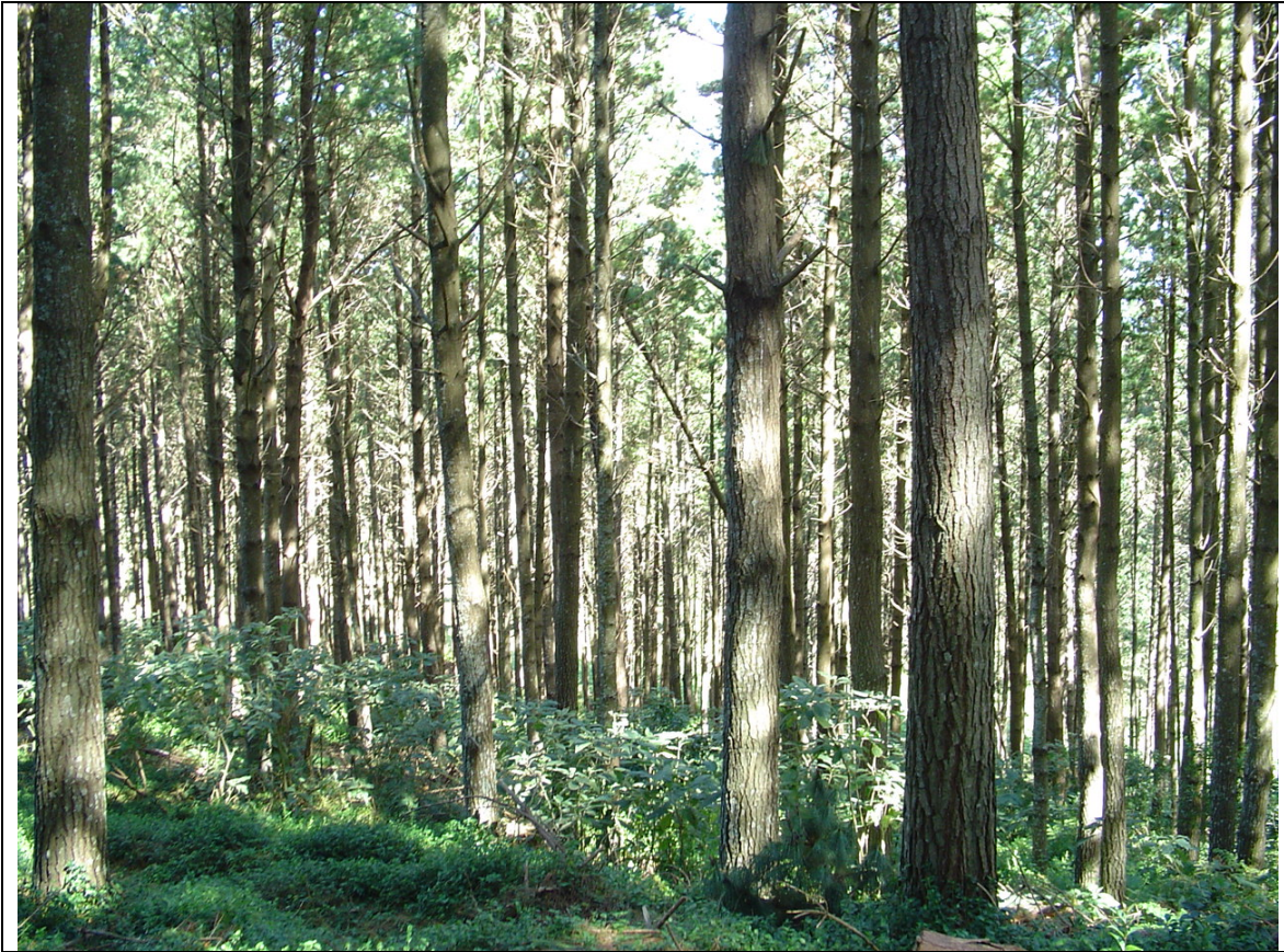
Interior of Radiata Pine forest, heavily infested with Woolly Nightshade